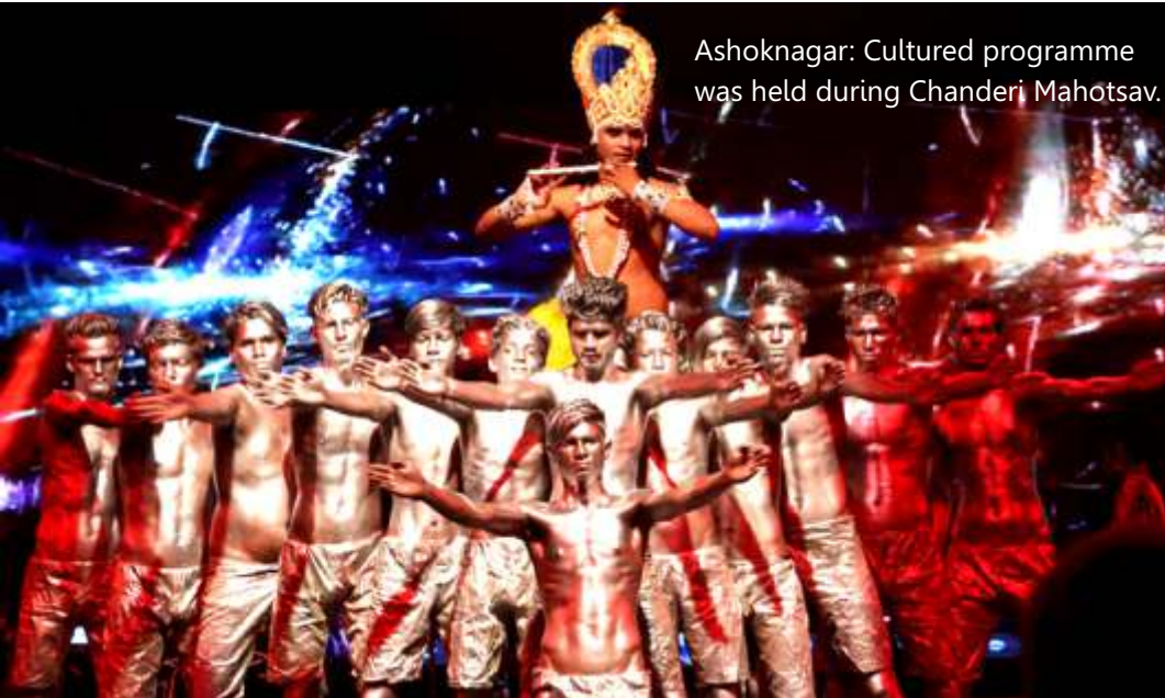
Ashoknagar: Cultured programme was held during Chanderi Mahotsav.