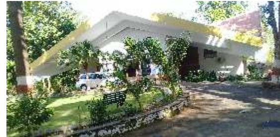
Resort and tourism centre at Parsili in Sidhi District.

Bhopal : the officers and managers were imparted training on GST by M.P. Tourism